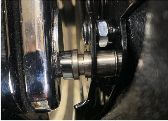
INCORRECT Brackets are not on the docking points and will not clamp on in this position

Once all 4 bolts have been tightened, you can mount the bags. With the handle pulled up, slide the bags on to the docking points, making sure the bracket sits in the grooves on the docking points (refer to pictures below). Push down the lever on the bag and you should feel it snap into place with about 20 pounds of force. If it is too difficult or too easy to push the handle down, the brackets may require adjustment (see next section). To remove the bags, lift up on the handle while holding up the spring loaded latch. The lock on the inside of the bag lets you lock the bags to the bike for theft prevention.