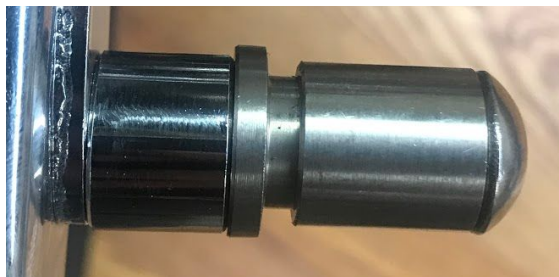
Stud mounted with 1/2" spacer

Replace the bolts in your strut with the new bolts one at a time, using blue thread locker. If there is a narrow plate behind your fender with an unthreaded hole at the rear, remove it and use the included nuts to attach the bolts (they are crimped jam nuts and may be difficult to start). If you have the nut plate with both holes threaded, you can use it instead of the nuts provided. In either case use thread locker to ensure they don't vibrate loose. Make sure the ends of the bolts stick out no more than 1/8" past the nut, or they may rub on the tire.