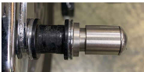
With Detachable backrest hardware

Replace the bolts in your strut with the new bolts one at a time, using blue thread locker. If there is a narrow plate behind your fender with an unthreaded hole at the rear, remove it and use the included nuts to attach the bolts (they are crimped jam nuts and may be difficult to start). If you have the nut plate with both holes threaded, you can use it instead of the nuts provided. Make sure the ends of the bolts stick out no more than 1/8" past the nut, or they may rub on the tire.